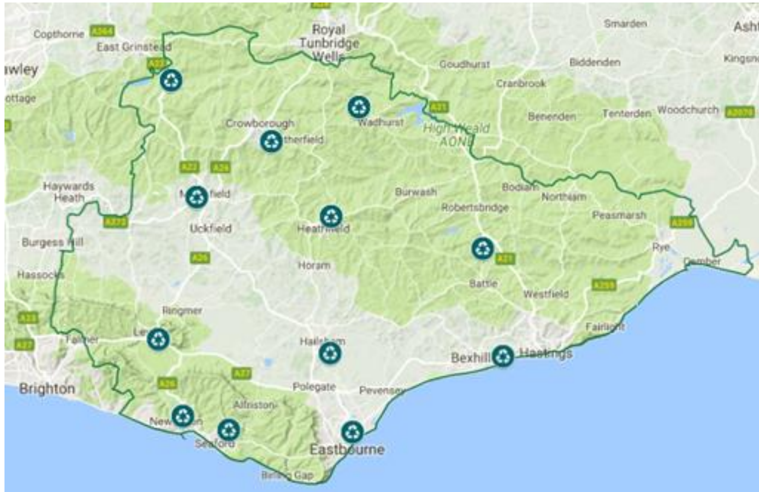
Map of Household Waste Recycling Site network