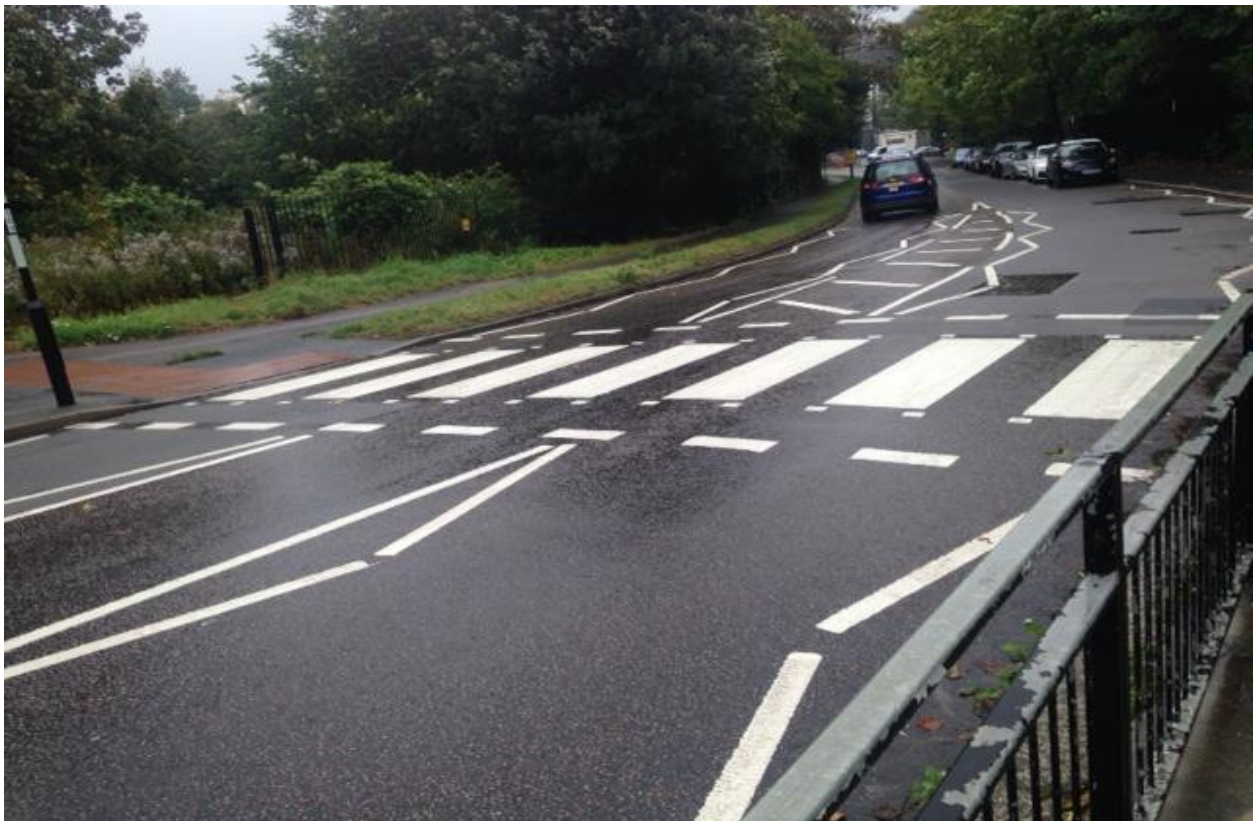
Bethune Way, Hastings – after remarking.