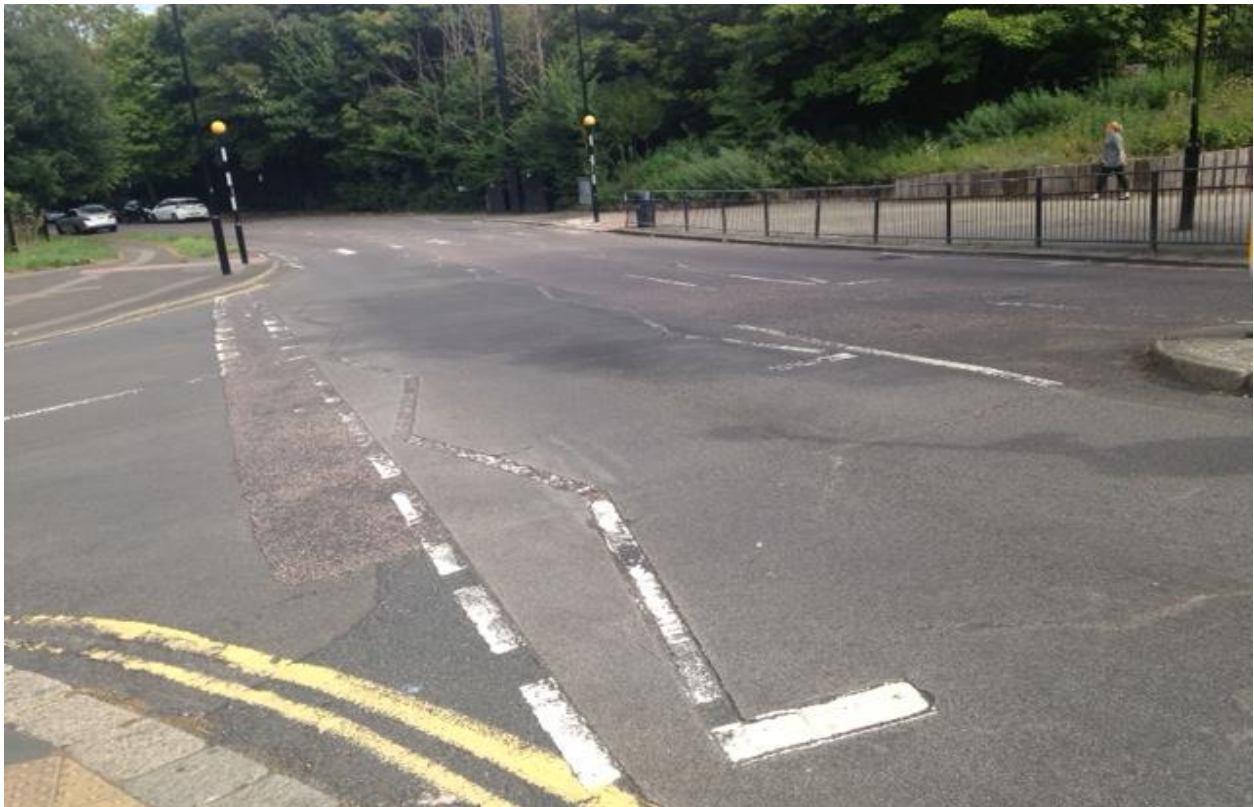
Bethune Way, Hastings - before remarking.

3. The desired outcomes from the scrutiny review are to improve the maintenance of road markings, clarify the prioritisation process for renewals and reduce the number of service requests.