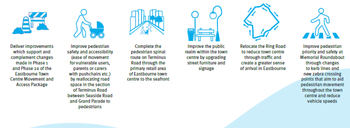
Figure 2 - Objectives of Phase 2b of Eastbourne Town Centre Movement and Access Package

The agreed objectives for Phase 2b of the Eastbourne Town Centre Movement and Access Package are to: