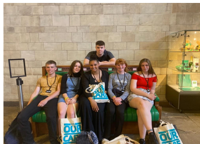
Our Care Rally - The Houses of Parliament