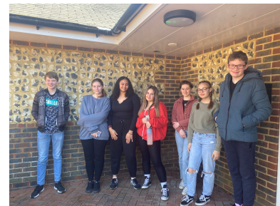
CICC members visiting Silver Birches residential care home