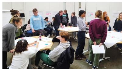
CICC collaboration - Connected Practice