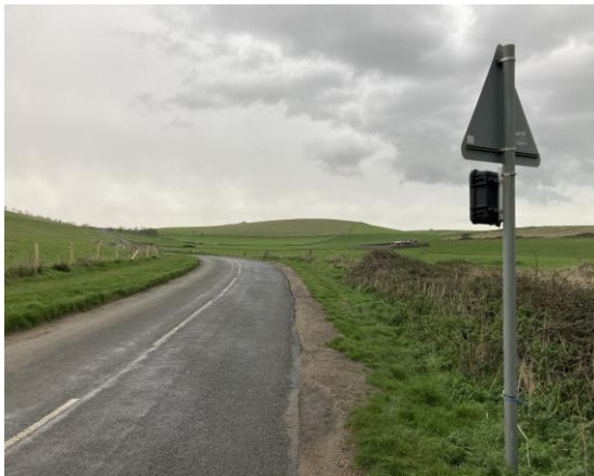
A6350 NB (2).jpeg