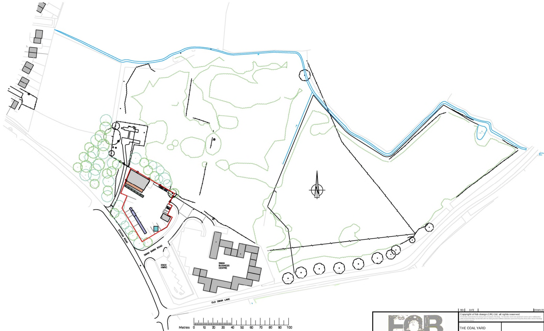
BLOCK PLAN THE COAL YARD, SWAN BARN BUSINESS CENTRE, HAILSHAM